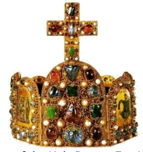
Crown of the Holy Roman Empire, which was tied to the Catholic church and lasted from the 10th—19th century.