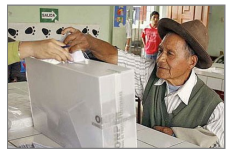
A man votes in Peru.

In a direct democracy , there are no representatives. Citizens are directly involved in the day-to-day work of governing the country. Citizens might be required to participate in lawmaking or act as judges, for example. The best example of this was in the ancient Greek city-state called Athens. Most modern countries are too large for a direct democracy to work.