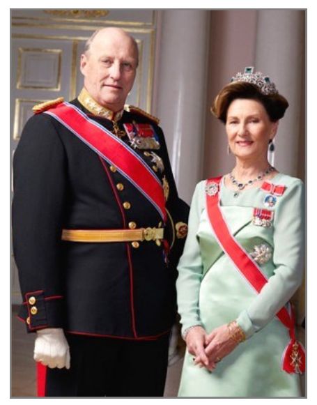
King Harald V of Norway with his wife, Queen Sonja. Norway is a constitutional monarchy. The king is the head of state and has a mainly ceremonial role. The actual government is a democracy.