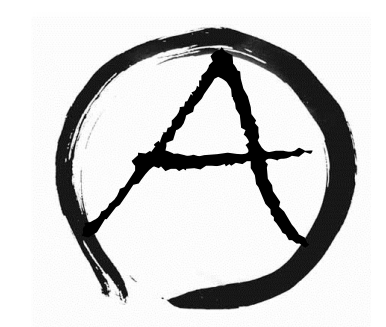
An A inside a circle is the traditional symbol for anarchy.

In an anarchy , nobody is in control—or everyone is, depending on how you look at it. Sometimes the word anarchy is used to refer to an out-of-control mob. When it comes to government, anarchy would be one way to describe the human state of existence before any governments developed. It would be similar to the way animals live in the wild, with everyone looking out for themselves. Today, people who call themselves anarchists usually believe that people should be allowed to freely associate together without being subject to any nation or government. There are no countries that have anarchy as their form of government.