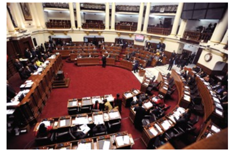
The Peruvian legislature